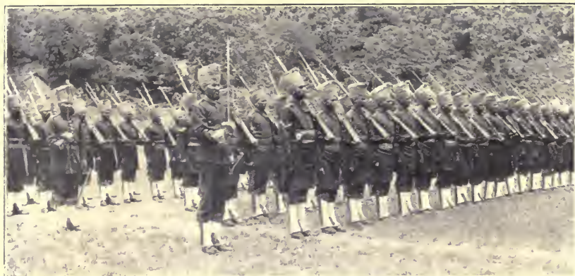
MY DOUBLE COMPANY.